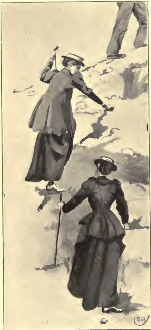
The ascent of Snowdon.